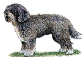
SPANISH WATER DOG